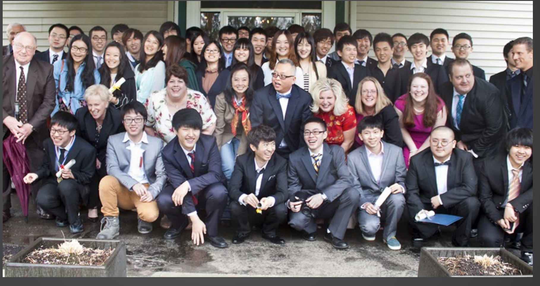
Students and staff members gathered at the Commencement Banquet to celebrate the graduation of Seniors from the class of 2013 as well as other award recipients

Being a part of each student's growth was both a joy and privilege. We wish them the very best in all their endeavors!