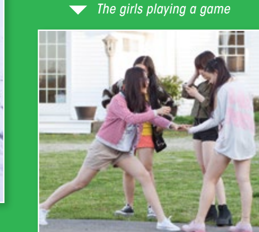
SNAPSHOTS OF STUDENT LIFE