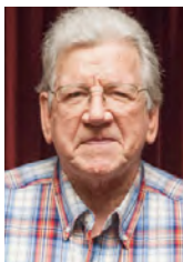
RH Miller Maintenance