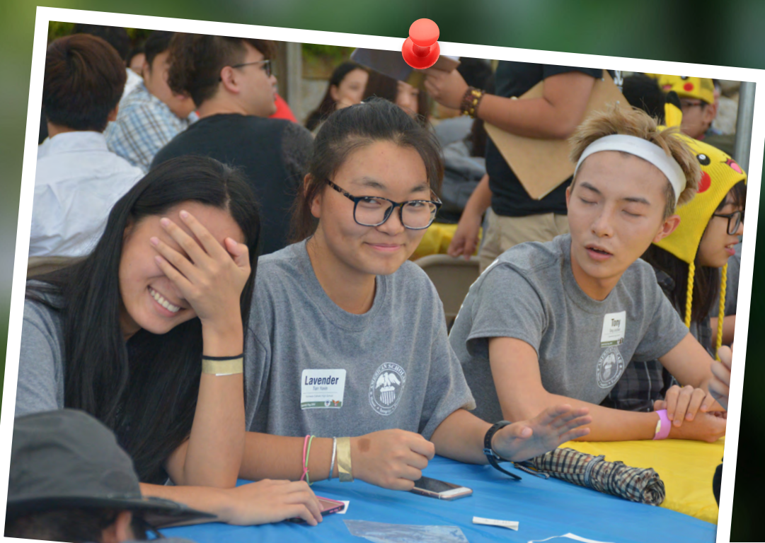
While all students finished the puzzle, the yellow, green and purple teams earned spots in the top three.